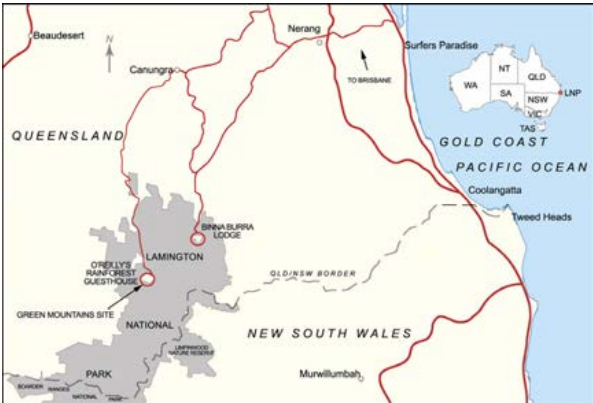
Figure 1. Generalized location maps of Lamington National Park (LNP)