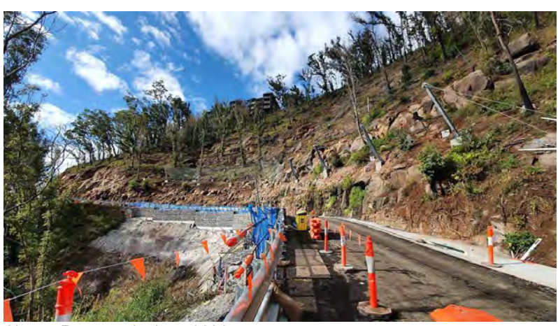
Above: Progress in June 2020.