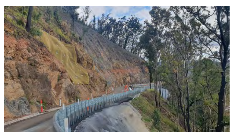
Above: Drape mesh, rock-fall protection and guardrail installed, June 2020