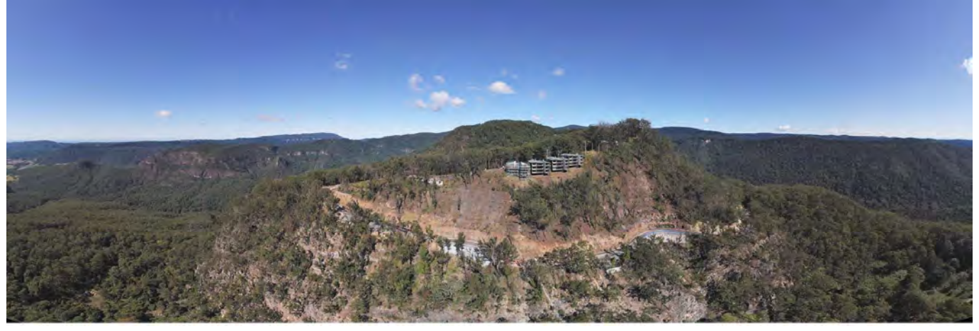
Above: Panoramic view of Binna Burra Road's main reconstruction site taken in May 2020.

The reconstruction works recommenced in mid-March 2020 and while they have remained complex, they are in their final stages. Most of the works upslope and downslope of the existing roadway have now been completed with one main site (referred to as Site 9, located 200m past the Rangers Station heading up the mountain) requiring further upslope works. Additional road works along Binna Burra Road will be required at various locations, including laying new bitumen seal and asphalt, line marking, installing signage, speed safety measures and environmental control measures. Eligible reconstruction works are jointly funded by the Commonwealth and Queensland Governments under the Disaster Recovery Funding Arrangements (DRFA).