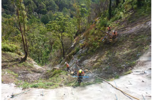
Above: Abseilers looking down slope, June 2020.