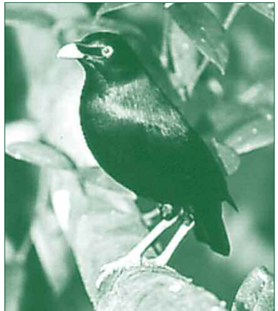
Satin Bower Bird

Satin Bower Bird - ( Ptilonorhynchus violaceus ) During mating season ( October-January ) females tour the bowers, sizing up the studs by their architectural prowess and by their talent at staging a dramatic display of feather-pulling, which includes extending the wings suddenly and running around accompanied by a loud buzzing, wheezing vocalization. The male seizes objects in his bill, adopts a trance-like pose with head low, eyes suffused lilac-pink, and he leaps sideways - all this, of course, to attract females to his bower. He then mates with females attracted.